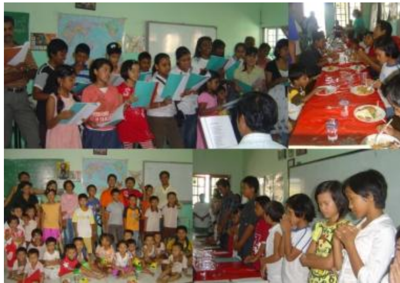
Sharing the joys of Christmas with the children at MEC