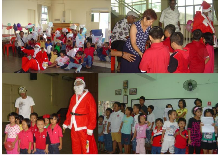
Bringing Christmas Joy to the children at St. Anne's Church, Port Klang